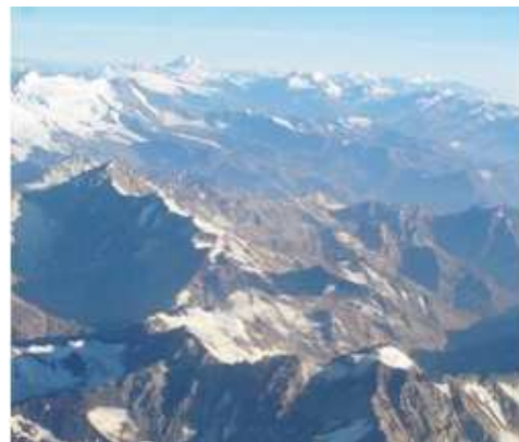
Andes mountains range