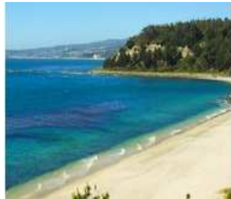
Beaches along the Pacific Ocean

For Spanish speaking ones an occasion to meet CLOVE friends, learn and visit Chile.